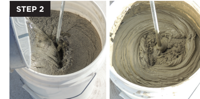
ADD water and MIX thoroughly.