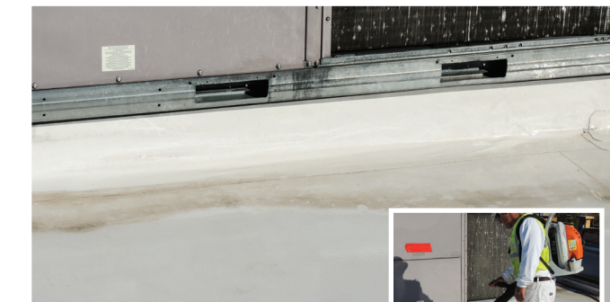
Make sure area is completely dry.