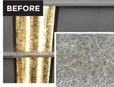
Fiberglass skylight BEFORE

Raised fiberglass hairs indicate age. Restore with Uniflex Skylight Restoration Coating.