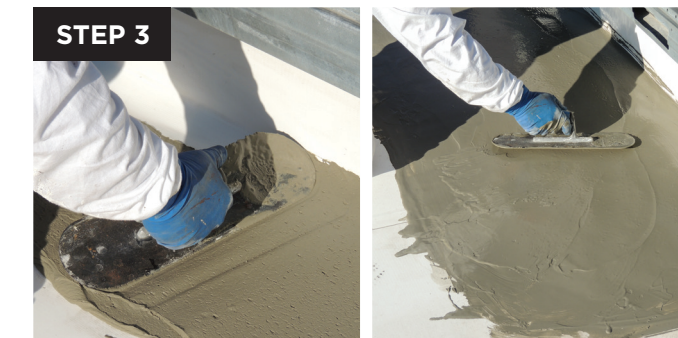
APPLY Uniflex Slope Builder to low-lying area and trowel, broom or squeegee into place.