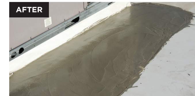
Once Uniflex Slope Builder is cured, coat over.