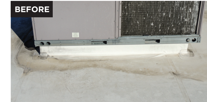
Area of ponding water at HVAC curb.