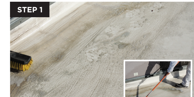
WASH area to clean surface.